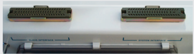
Rear panel view

A second device connector fitted to the rear panel allows the unit to be left permanently connected whilst using a fixture or other ART serially controlled modules.