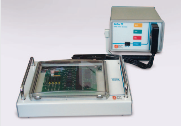
Autocal connected to Reflex 10

When used in conjunction with ART's Reflex or RT290 parametric systems, the Autocal unit offers fast and simple system calibration/self-test.