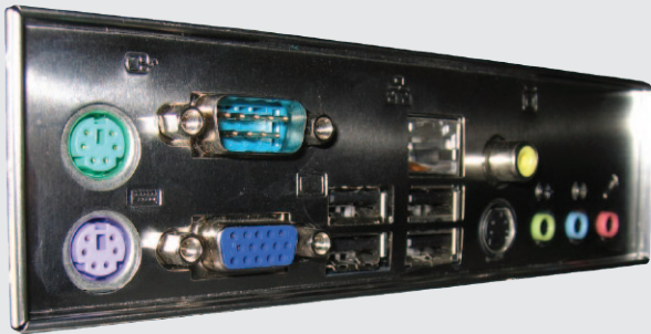
Optional integrated PC

The system comprises of a 6U high 19 inch rack, which is sub-divided into an internal 3U low voltage rack housing a PC interface and low leakage detector and a 6U card frame into which can be configured a selection of high voltage power supplies and switching multiplexers. The system is controlled using the supplied Artworks software running on a standard Windows™ based PC which may be internally or externally mounted.