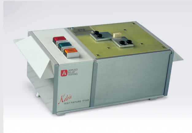
Example: TF100 fitted with bench mounting option