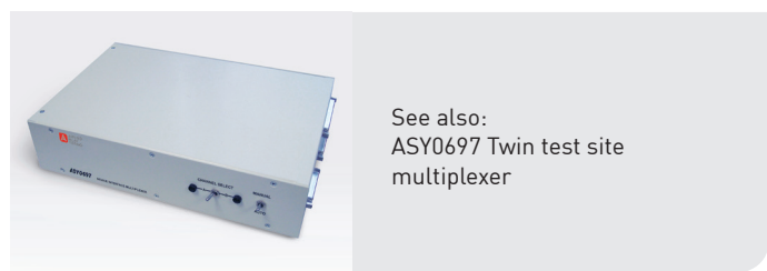
See also: ASY0697 Twin test site multiplexer

The earth bonded all-steel construction provides a high level of screening. Additionally all parametric signals are fully screened to optimise signal quality in electrically noisy environments.