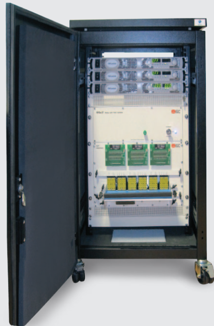
Example: Built-in manual control tool

A host PC is used to configure the start of the life test and to routinely collect the life test data during the course of the test. The software allows the user to display the life test results for any of the modules to which it is connected. The system can be supplied either with an integrated or external controller as required.